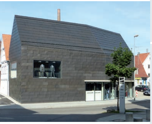
Venusblei façade on the Pierre Cardin outlet in Metzingen.